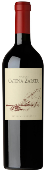
CATENA ZAPATA Nicolas Catena Zapata

Nicolas Catena is widely credited with helping put Argentine wine on the map through a strong and consistent focus on quality. This namesake wine reflects that same attention to quality, with the precision in winemaking and deep respect for nature and terroir that define the Catena family.