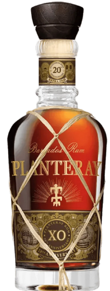
PLANTERAY RUM XO 20 th Anniversary

Crafted in Barbados, Planteray Rum's XO 20 th Anniversary is a celebration of time, tradition, and expert blending.