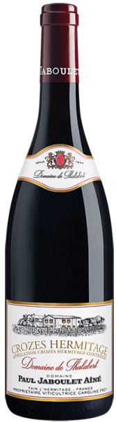
PAUL JABOULET AÎNÉ Crozes-Hermitage Rouge "Domaine de Thalabert"

From one of the Rhône Valley's most historic houses, this 100% Syrah from old vines delivers depth and structure.