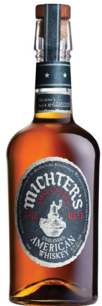
MICTHER'S US*1 American Whiskey

From Michter's, Drinks International's Most Admired Whiskey Brand three years in a row, comes their American Whiskey. Unlike bourbon or rye, this unblended whiskey is not aged in new oak, instead utilising whiskey-soaked barrels, resulting in a softer, more nuanced profile.