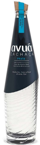
AVUA CACHACA Prata

Cachaça is a spirit with almost five hundred years of history. It is a distilled spirit made from fresh sugarcane juice and can be made in any part of Brazil.