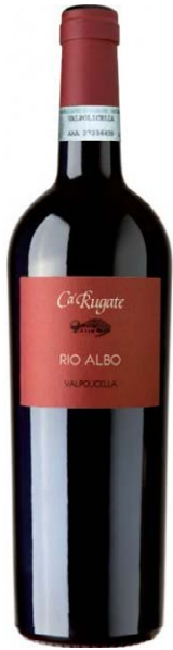
CARUGATE Rio Albo Valpolicella

A new wine to Young's inventory is this amazing wine from Valpolicella in Italy.