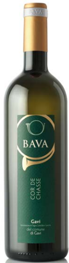
BAVA Gavi di Gavi

Want to try something different, but afraid to venture away from your favorites?