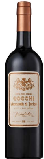
COCCHI Vermouth di Torino

Cocchi is synonymous with quality in the vermouth world. Made to a family recipe created more than 100 years ago, Cocchi's rich, intense, well-rounded flavour sets it apart from the competition. With enticing notes of red fruits and orange, this is a versatile vermouth that is delicious served on its own with ice, but also makes a great base for a range of cocktails, including a Manhattan, Martinez or Negroni.