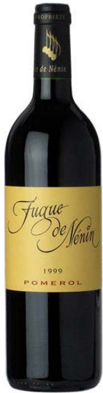
FUGUE DE NENIN 1999

Fugue comes from the sandy clay soils in Bordeaux found in the eastern part of the Château's vineyards, as well as from the young vines planted on the great plateau terroirs. This second wine is a typical example of the charm of Pomerol. The wines are smooth and silky and can be enjoyed earlier than those of the Grand Vin. This wine is made up of 90% Merlot and 10% Cabernet Franc, making this a refined, full bodied wine with round tannins and a fresh finish.