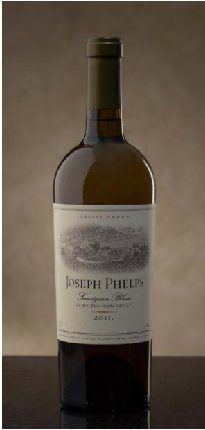
Joseph Phelps Sauvignon Blanc

Young's is excited to be the distributors for Joseph Phelps for The Bahamas, and this wine shows all the qualities of this exceptional house.