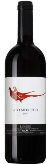
Gaja Sito Moresco

In Piedmont, Italy, Truffle Season has just started! These mesmeric morsels are hauntingly good, just like the wines from Piedmont, and who better to represent the wines of this area than Gaja!