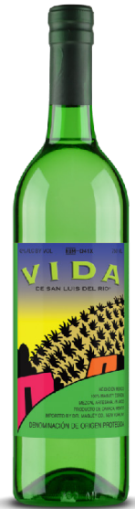
DEL MAGUEY Vida Mezcal

Del Maguey is synonymous with quality. A smoky, agave forward mezcal that is fantastic for cocktails or on the rocks for sipping.